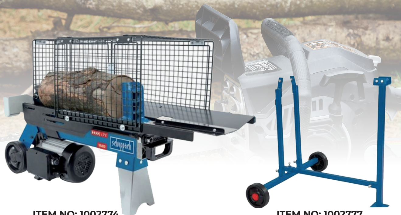
ITEM NO: 1002774

Log splitter from Scheppach in sturdy powder-coated steel construction. 2-hand operation and hydraulic cylinder with automatic return. Safety grid over the splitting zone.