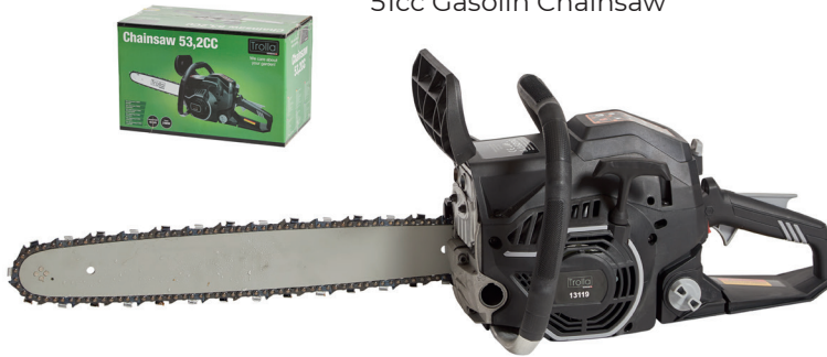
ITEM NO: 13119 51cc Gasolin Chainsaw