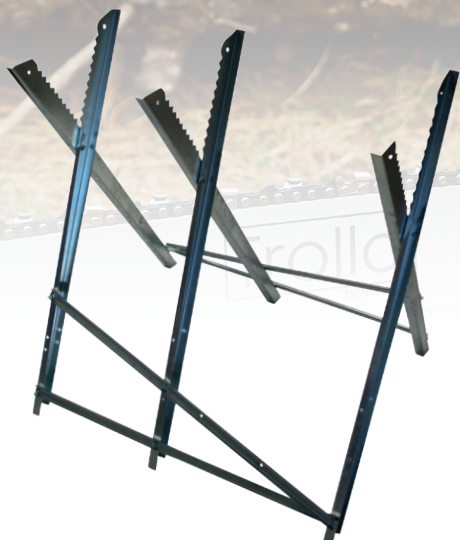
ITEM NO: 12237 WEIGHT: 6,2 KG

Metal sawhorse for holding the wood while cutting it into firewood pieces. Stands firmly on the ground with 6 legs, handling up to 180 kg of wood at a time. Can be folded after use. Delivered unassembled.