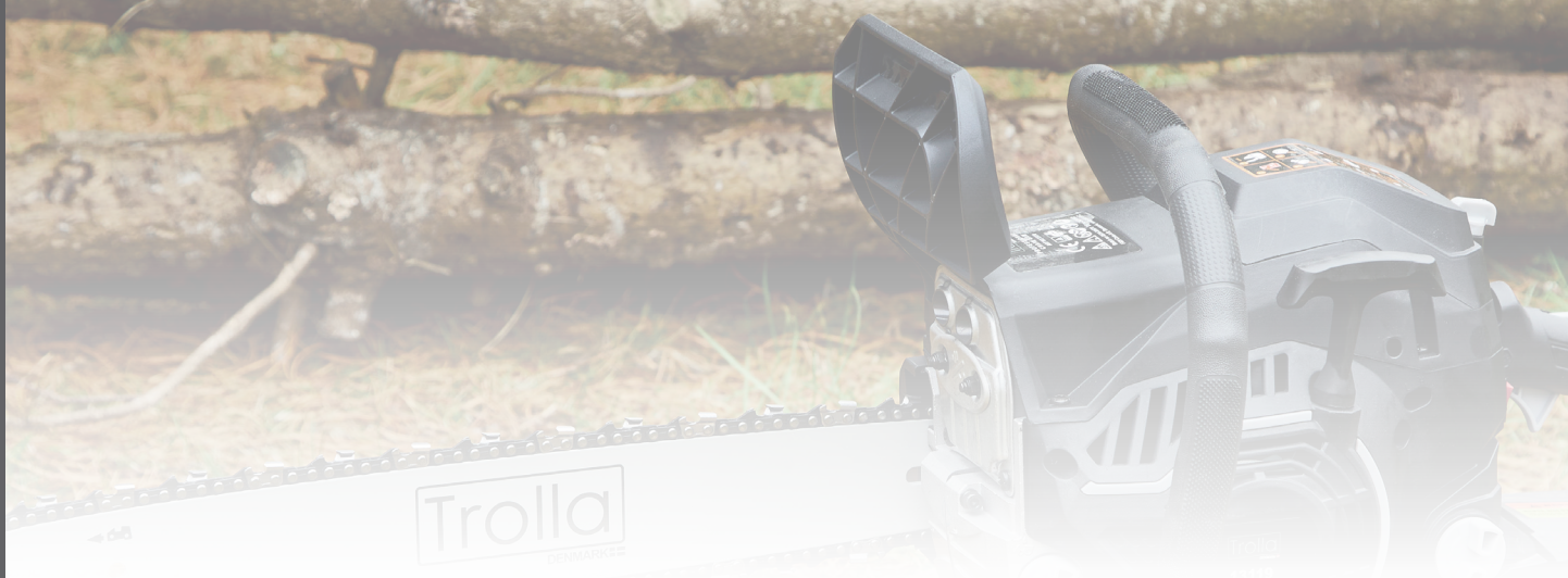
ITEM NO: NEWLOG1 2x20V Brushless chainsaw