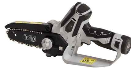
ITEM NO: 13120 12V Li-ion Mini saw

12V Li-ion- 2.0Ah battery pack Guide bar length: 158mm=6" Chain pitch:7.6mm, 14 teeth No load speed:3700min-1 Cutting width: Dia<100mm Compact, handy design SDS chain tension system With double kick-back production design Soft grip handle Fast charge, charging time: 60-90min. 1 x chain saw bare machine 1 x chain, 1 x bar, 1 x chain& bar cover