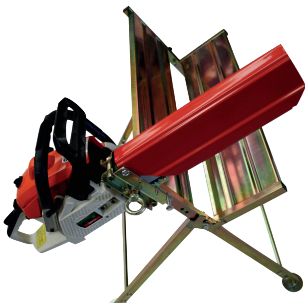
ITEM NO: 12238 WEIGHT: 11,6 KG

Sawhorse for shortening firewood logs where the chainsaw is attached to the metal stand. The chainsaw can be tilted up and down within the protective shield during cutting. Dimensions: 880x710x960 mm. Delivered unassembled.