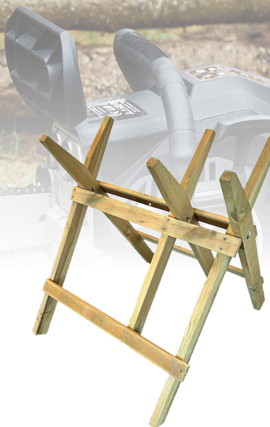
ITEM NO: 12236 WEIGHT: 5,4 KG Sawhorse in wood

Metal sawhorse for holding the wood while cutting it into firewood pieces. Stands firmly on the ground with 6 legs, handling up to 180 kg of wood at a time. Can be folded after use. Delivered unassembled.